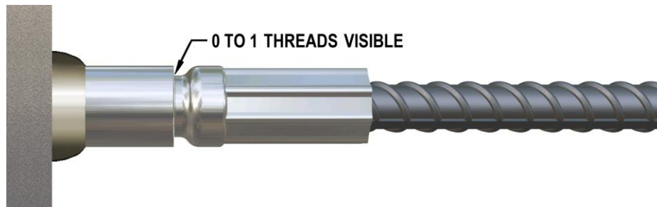
FIGURE 3: ASSEMBLED CONNECTION

NOTE: If the Male threads do not properly engage the Structural Connector during assembly, stop immediately. Disassemble the connection to determine the problem. Possible causes of mis-assembly may be mis-matched thread sizes, contaminated threads (i.e. concrete, dirt, etc.) or damaged threads. Re-assemble only after the problem has been identified and corrected.