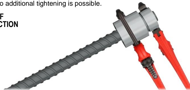
FIGURE 3: FINAL TIGHTENING OF ASSEMBLED CONNECTION